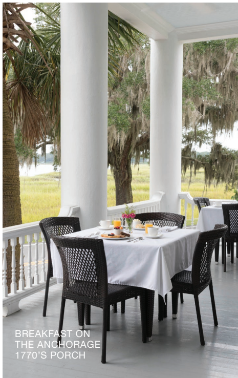
BREAKFAST ON THE ANCHORAGE 1770'S PORCH

decadent meal. With seating for only about twenty guests, reservations are required in the dining room, but if you're in the mood for lighter fare, small plates and beverages are served on the inn's two balconies when the weather permits. For those ready to step out and explore, preorder a picnic lunch and take a walk along the Harbor River waterfront, or rent a bike to traverse the Spanish Moss Trail, a ten-mile greenway that connects Beaufort and Port Royal, ideal for cyclists, walkers, and joggers.